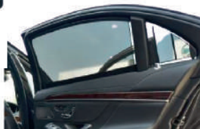
Sun protection for windows